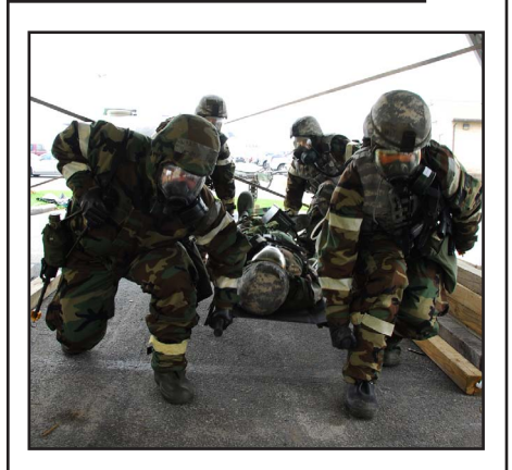
Airmen put their self-aid and buddy care knowledge to use as they transport an inspection "casualty" during the 193rd's operational readiness inspection, May 2008.