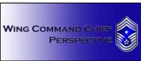
Wing Command Chief perspective Page 2