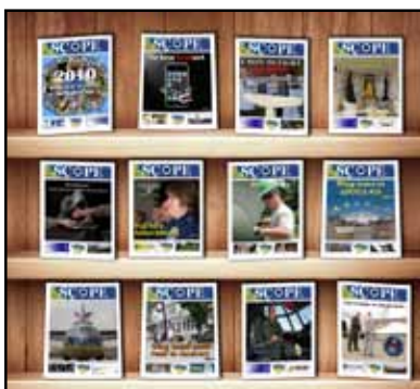
A compilation of the covers from the 2011 editions of Scope provide a look back at the events from the course of the year.