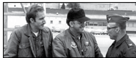
40 years of service awarded Page 6