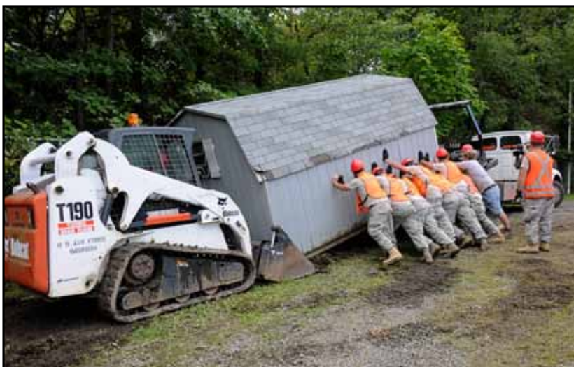
Airmen from the Pennsylvania Air National Guard's 201st Red Horse squadron assist with clean-up and flood relief efforts in Pine Grove, Pa., Sept. 10, 2011. The Airmen are working with Schuylkill County Emergency Management Agency in assisting with traffic control, disaster assessment efforts, debris removal and clean-up and relief efforts through the rest of the weekend.