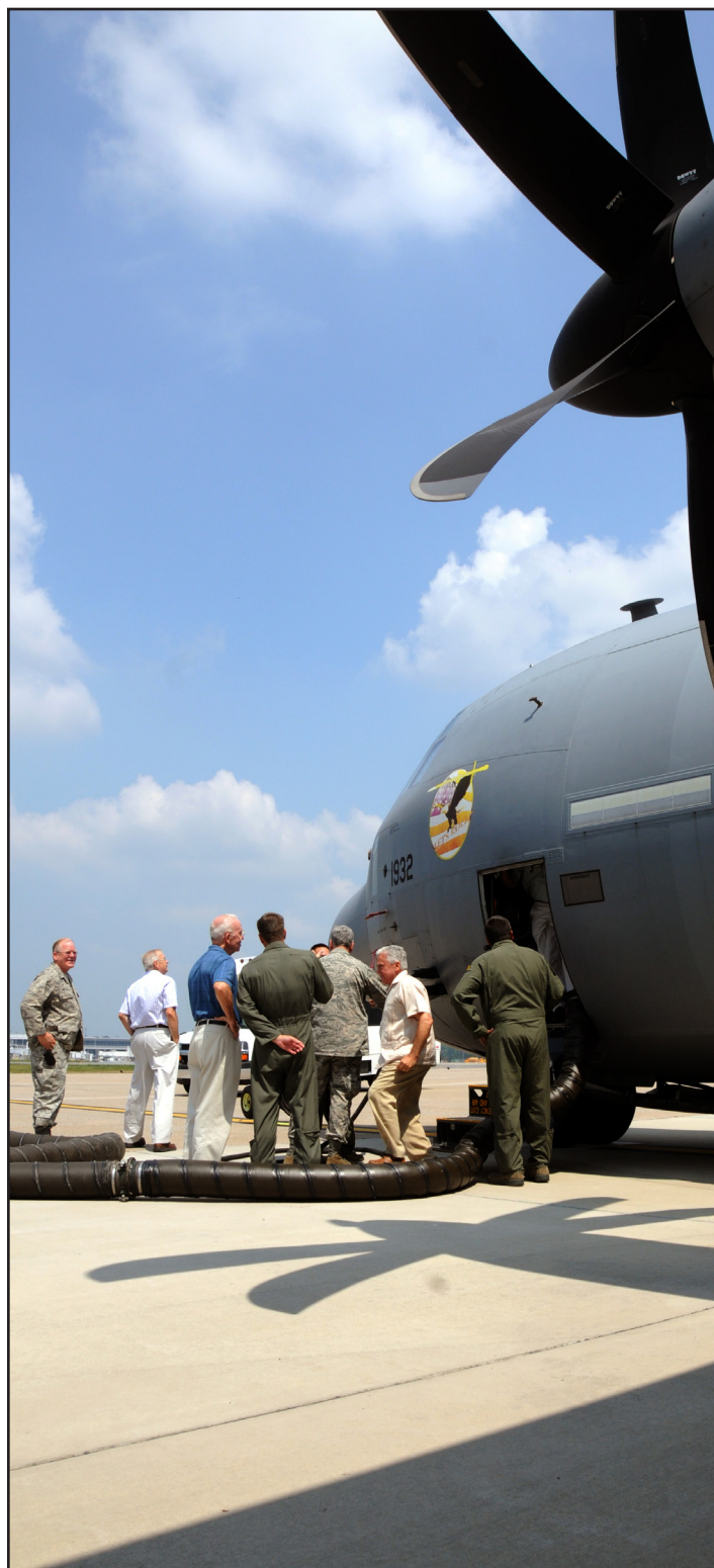
Past wing and group commanders of the 193rd Special Operations Wing at Middletown PA toured the EC130-J Commando Solo during their visit on Tuesday, July 19. The commanders were briefed on upgrades the unit has made to its aircraft, facilities and organization and included a tour of the wing's Regional Support Group at Ft. Indian-town Gap, Annville PA.