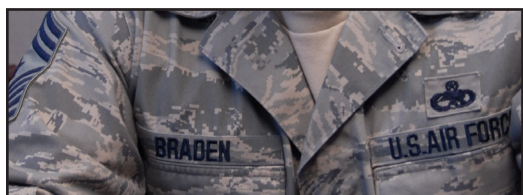
State Command Chief says goodbye