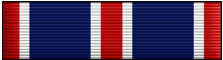
The Air Force Outstanding Unit award ribbon can be worn by all Airmen in the Wing during the time period of Oct. 1, 2009 to Sept. 30, 2010. The Wing will also receive a new streamer to add to the other 14 that already decorate the Colors.