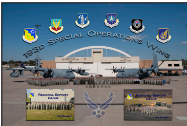
The Airmen Air Stations 1, 2 and 3 make up of the 193rd Special Operations Wing, seen here in the 2010 Wing photograph.