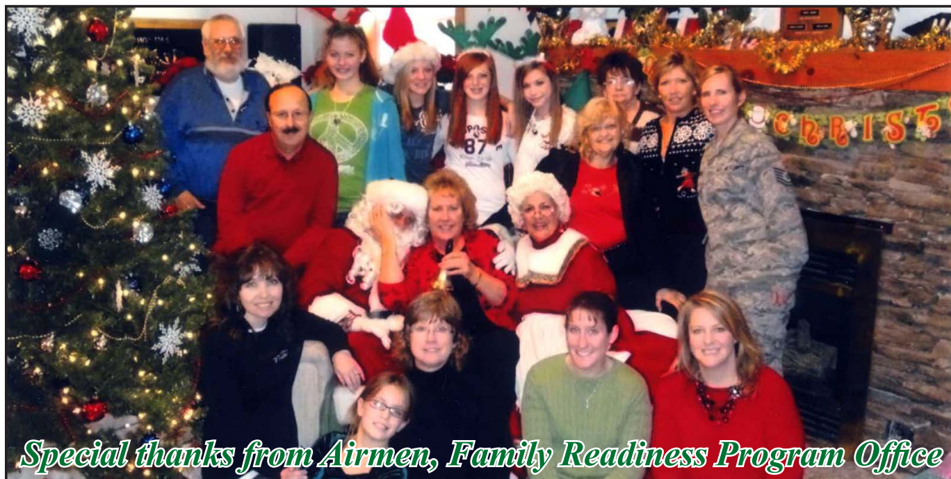
Special thanks from Airmen, Family Readiness Program Office

The Children's Christmas Party was a huge success this year. The 193rd SOW Airmen and Family Readiness Program Office Staff and volunteers hosted the event for 90 children and 69 adults. After visiting with Mr. and Mrs. Claus; each child received a goody bag filled with candy, coloring book, McDonald's gift cards, and Hershey's Chocolates, provided by the 193rd Air Station 3 Family Readiness Group Volunteers. A big "Thank You" to all who participated in this festive event! (Photo provided by Family Support Office)