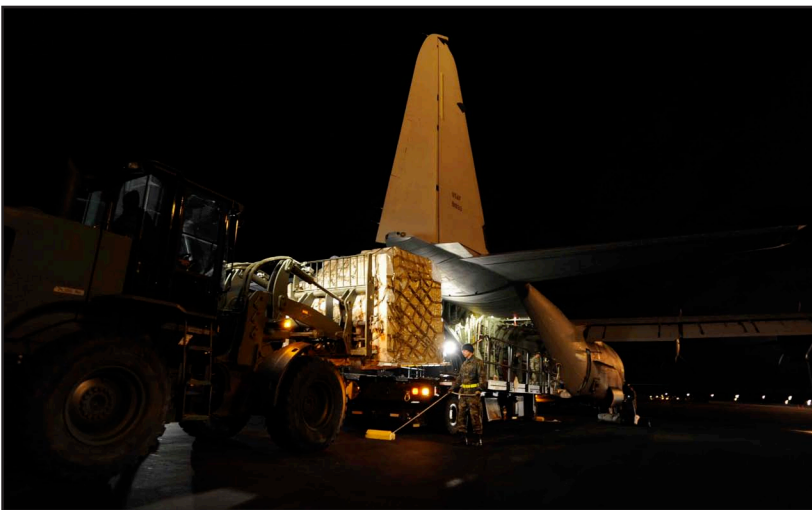
A forklift places a pallet of relief supplies into the cargo area of a C-130 as the crew prepare the aircraft for flight into Haiti's airport. More than 100 tons of supplies were taken into Haiti by way of the 193rd Special Operations Wing's C-130 aircraft during the Wing's participation in Operation Unified Response.

The 193rd Medial Group deployed to Hawaii for six days as part of the Hawaii Medical Innovative Readiness Training program. Twenty-eight Airmen participated in the mission, providing free health and dental screening to the people of Hilo, Hawaii and the surrounding areas.