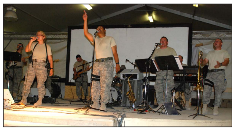
The U.S. Air Force Central Command band High Altitude, of the Air National Guard Band of the Mid-Atlantic, performs in the Fest Tent at Kandahar Air Field. During High Altitude's first deployment to the CENTCOM area of operations, the band belted out a mix of classic rock and pop hits.